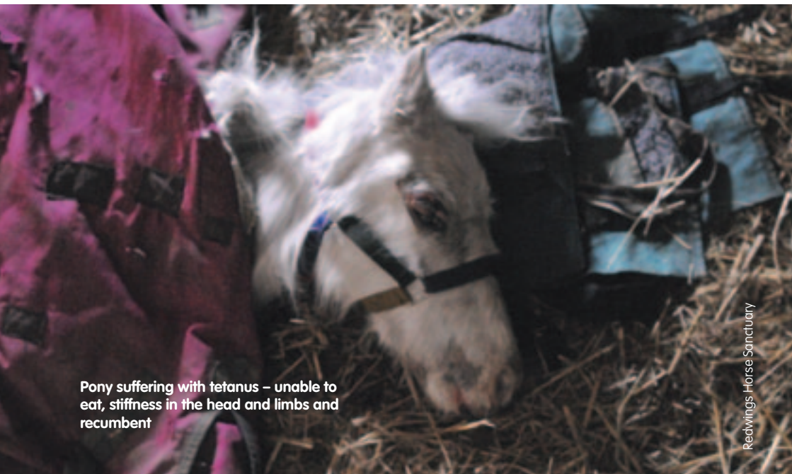
Pony suffering with tetanus – unable to eat, stiffness in the head and limbs and recumbent