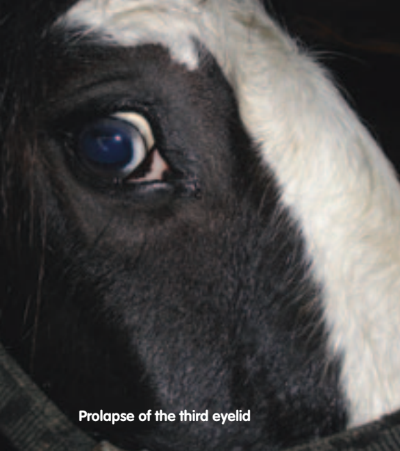
Prolapse of the third eyelid