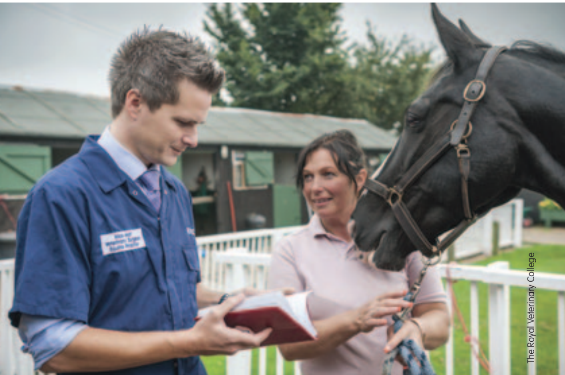
The Royal Veterinary College