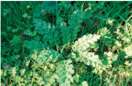
Above: Ragwort at the rosette stage

To safeguard your horse ensure all ragwort is removed from their pasture which is often achieved by pulling the plant up or spraying the land with an appropriate herbicide. Ragwort must never be left on the pasture as it becomes more palatable to horses in its dried form but retains its poisonous properties. When handling the plant it is strongly advised to wear gloves and a face mask due to the potential risks of absorbing the toxins through your own skin or inhaling the pollen. For further advice on removing and disposing of ragwort and also for help on what to do if your horse's pasture is surrounded by ragwort, refer to the BHS Ragwort Toolkit, available at bhs.org.uk .