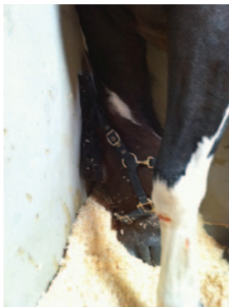
Below: Horse exhibiting a classical sign of liver damage by head pressing against the stable wall