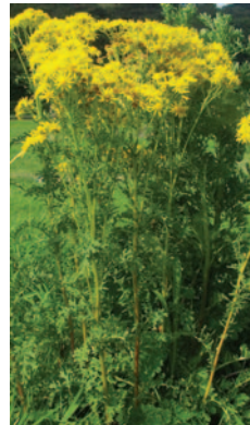
Right: Ragwort at the plant stage

The British Horse Society Abbey Park, Stareton, Kenilworth, Warwickshire CV8 2XZ Tel: 02476 840517 Fax: 02476 840501 www.bhs.org.uk Email: welfare@bhs.org.uk